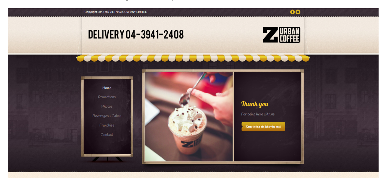
Figure 1: web homepage of Z Urban Coffee (2014)

This name may have provided the inspiration for the (Vietnamese) creation of "Z Urban Coffee" (<a href="http://www.zurbancoffee.com/">http://www.zurbancoffee.com/</a>). The choice of the letter Z as a quasi-standalone allows its connotations to surface with exceptional clarity.